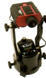
TruPulse200x Mapping Laser Shown w/TruAngle